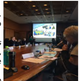
Above: Council members during the WWCS presentation

WWCS has expanded programming to meet the needs of the female population. These programs include: