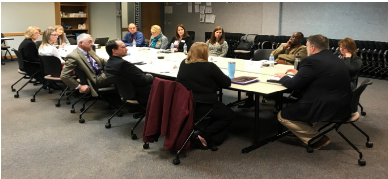
Above: Council Meeting on March 11, 2020