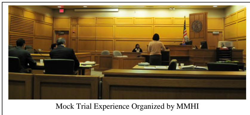
Mock Trial Experience Organized by MMHI

In addition to therapy, interns conduct assessments using interviews, intellectual and neuropsychological tests, objective and projective personality tests, and behavioral observations. Psychological evaluations help determine if an offender will be sent to prison, program needs in prison, whether to release an offender back into the community, and other important decisions. Psychological evaluations may also address an offender’s mental health treatment needs or risk for violent behavior. Interns are actively involved in learning to provide consultation to professional and non-professional staff regarding an offender’s management or need for programming.